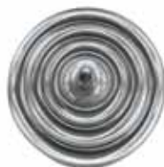
(1) Lid with Concentric Ring Cover Set (Included)